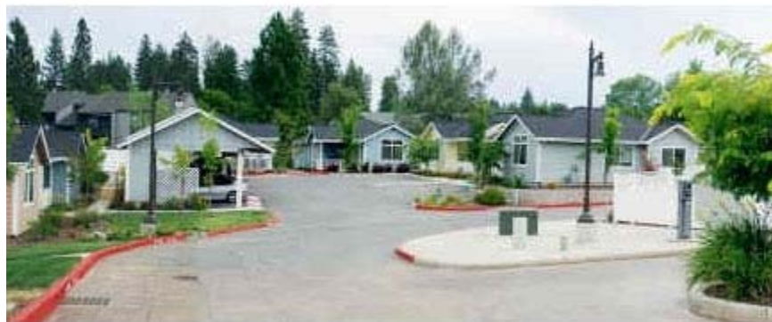
The Cottages at The Highlands

Come and see for yourself. Compare these new homes to others in Grass Valley and you will find they are a great value. You can have a newer home in a well planned neighborhood vs. an older home or fixer upper.